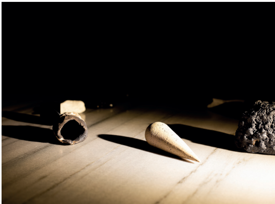
Jen Bowmast Calling in the Divine (detail) clay, copper, glass, marble, nephrite jade, obsidian, peppercorns, rope, sugar, wood 2019